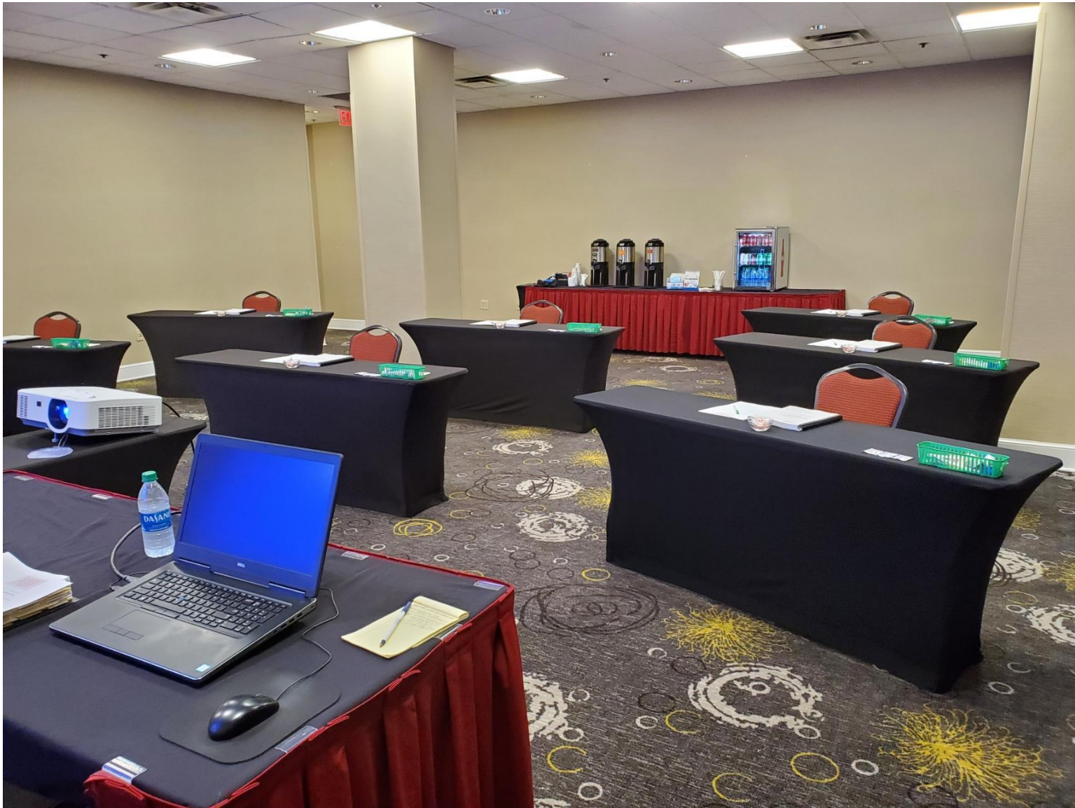
Photo of Typical COVID-19 Classroom Setup (Atlanta Seminar, August 4-6, 2020)

See https://www.earthworksoftwareservices.com/faq.htm#covid19 for related information